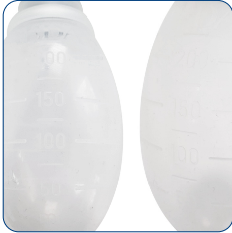
Clear volume measurements

This type of bellow would typically be used for: ENT & Maxillofacial, Neurosurgery, Abdominal, Mastology, Vascular and Orthopaedics